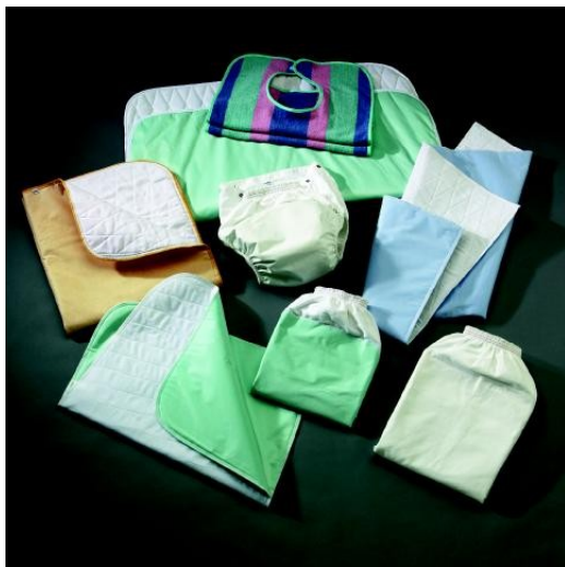
Just a few of our incredible products

UNDERPADS... DIAPERS & BRIEFS... CLOTHING PROTECTORS... AND MUCH MORE!