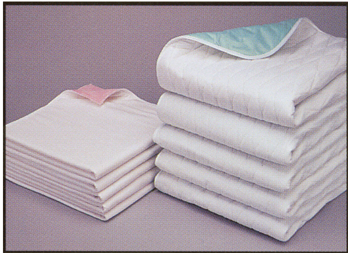
Alegra® Premium Comfort Pad—The One & Only